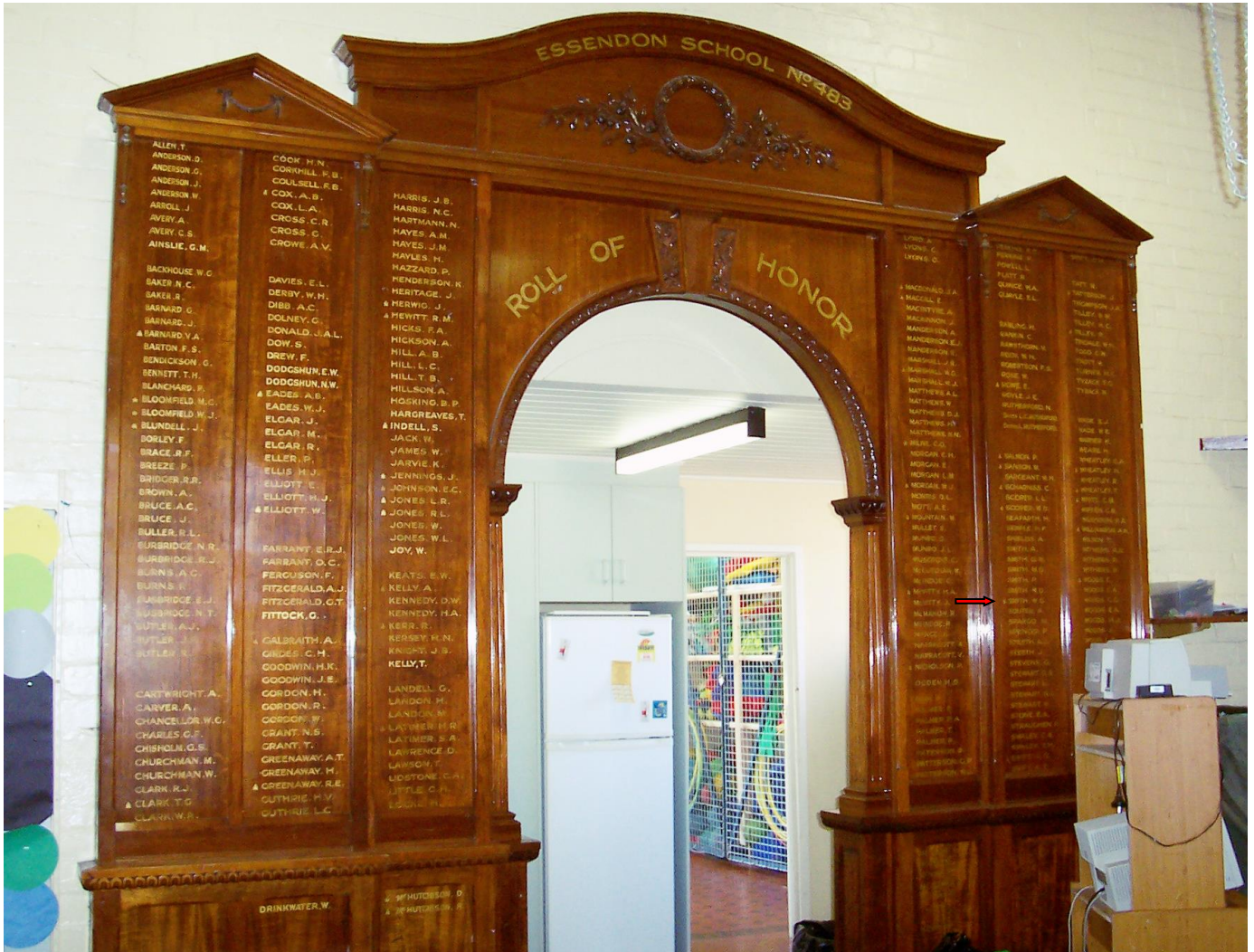
Essendon School Roll of Honour