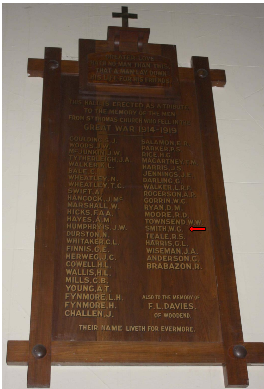
Moonee Ponds Anglican Church Honour Roll