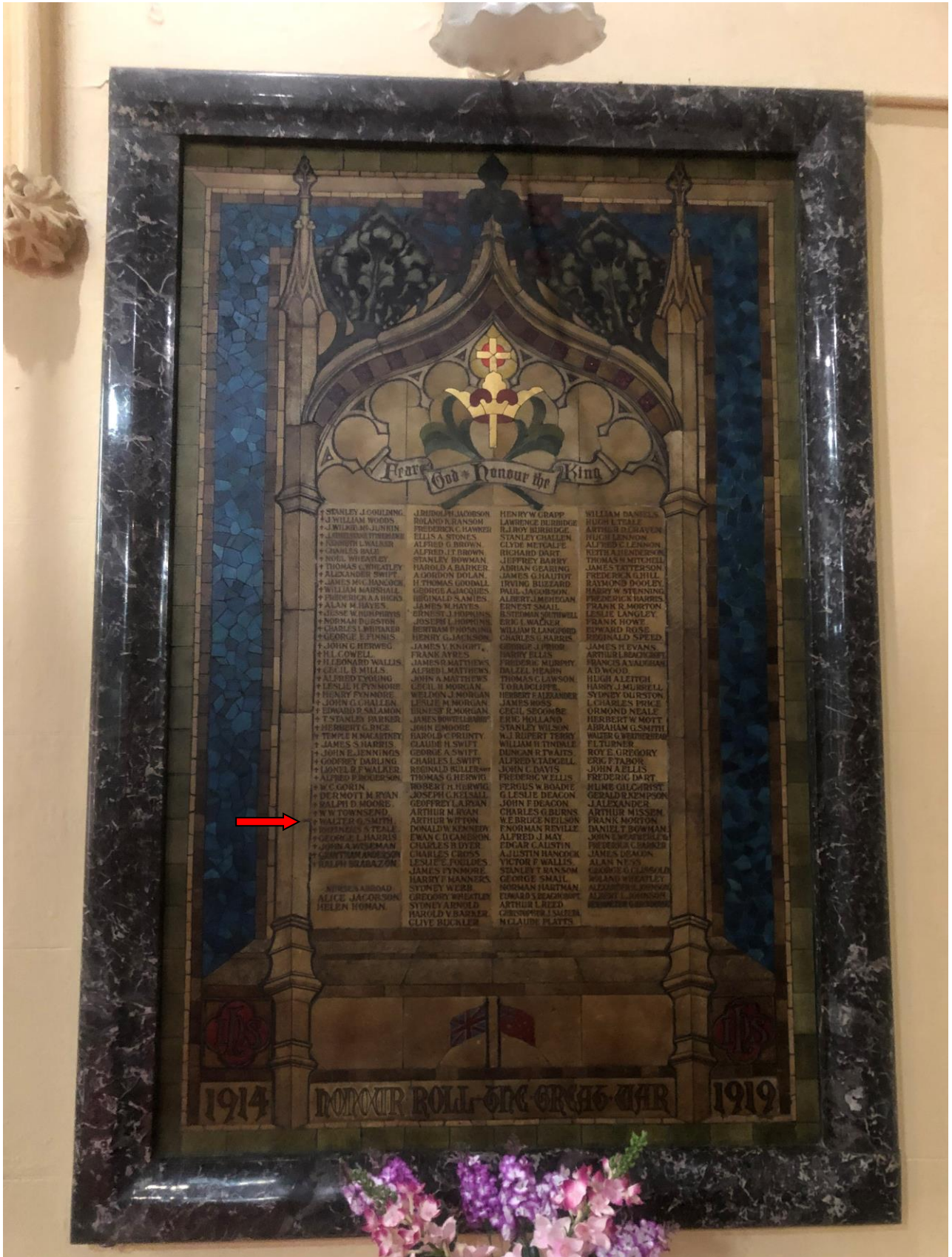
St. Thomas' Anglican Church Honour Roll